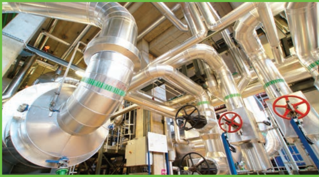
PETROCHEMICAL & CHEMICAL