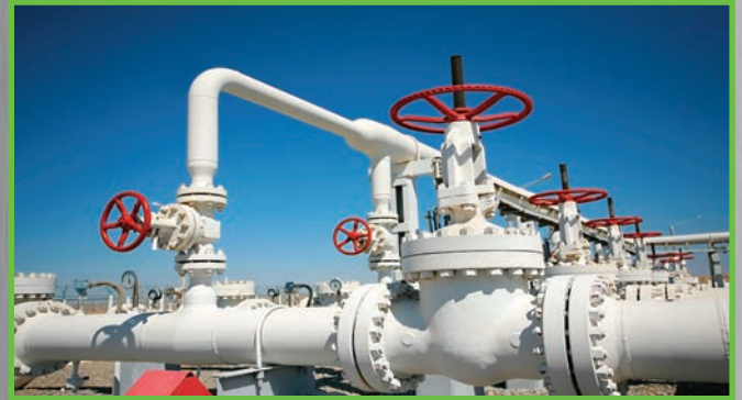
PIPELINES & GAS PROCESSING