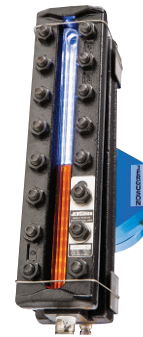
Jerguson LumaStar ™ Level Gage Illuminators