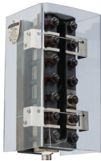
Jerguson SafeView ™ Safety & Protection