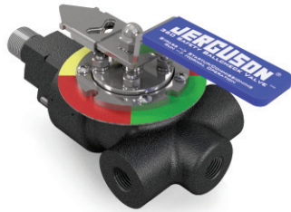
Jerguson 360 ™ Valve