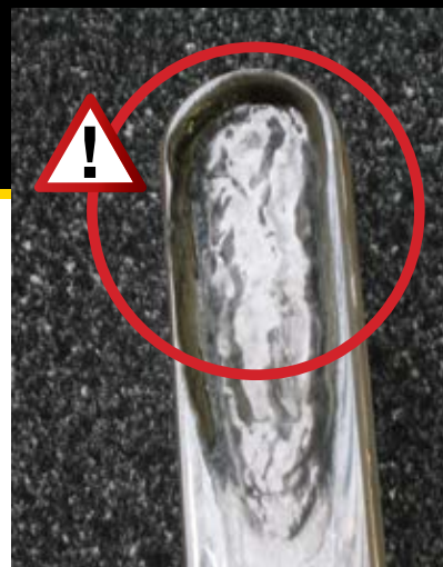
Dangerously eroded gage glass. Eroded glass is often not visible without inspection of disassembled gage.