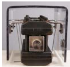
SafeView Shields mounting accommodates all standard flat glass gages.

– Project Engineer, Major Chemical Company